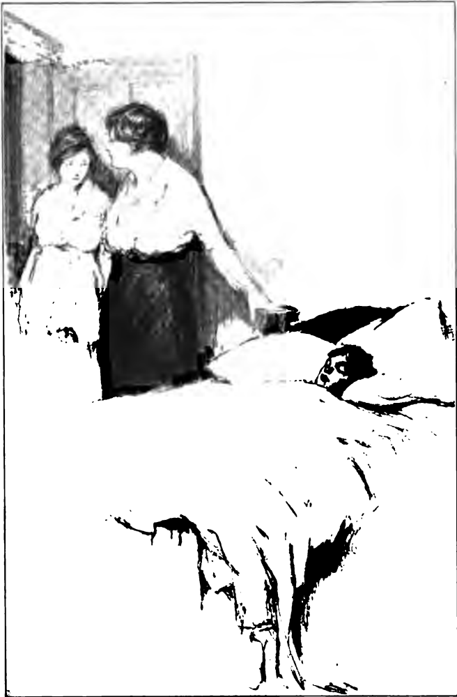
HENRIETTA GLANCED AT HER QUICKLY, AS IF SUSPECTING SOMETHING